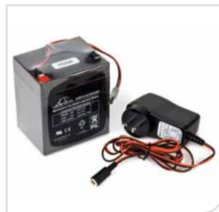
3M™ Rechargeable Battery 2200RB