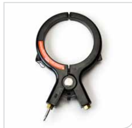
New 4.5 inch Dyna-coupler 4001 Standard on Utility Style Kits